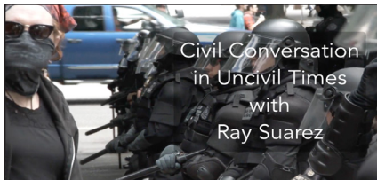
Civil Conversation in Uncivil Times with Ray Suarez