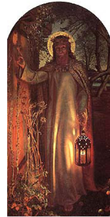
"Light of the World" (1851-53) British Pre-Raphaelite painter, William Holdman Hunt (1827-1910)

Most Episcopalians are scared of the book of Revelation. Some of that is due to its strange imagery. Some of that is how the book has been used to make crazy and often frightening predictions. During these unsettling times, Revelation is a book that, when explored properly, unlocks a world that, while radically different, speaks a message of hope and comfort to us.